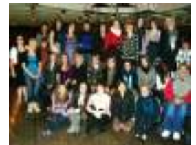
Encounters Canada group

During my week in Ottawa I made many friends that I will be staying in contact with. All the monitors and leaders were extremely kind and made you feel very comfortable. My week was extremely fun; this was an experience of a life time. I recommend you check this program out!