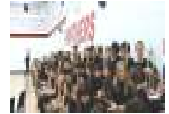
Grade 8 band

This month the grade eight and grade ten bands will be attending the Winnipeg Optimist Band Festival in Winnipeg. The grade eight band performs Tuesday February 23 rd at 12:50 pm at the Winnipeg Convention Centre located on York Ave. The grade ten band will perform Wednesday February 24 th at 6:25 pm at the Winnipeg Convention Centre as well. The bus for the grade ten band will leave at 5:00 pm and will be returning after 9:30 pm.